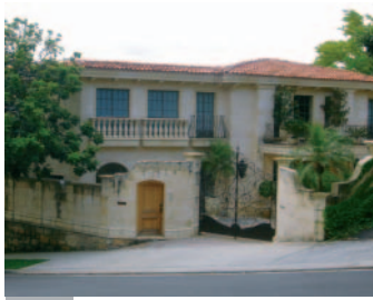
Q2 63 Wolseley Road, Point Piper $21.5million