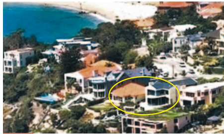
Q2 4 & 6 Burran Avenue, Mosman $20-21million