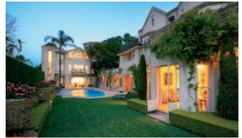
Q3 7 Rose Bay Avenue, Bellevue Hill $15.5-16million

highest value and total value of top 10 transactions per quarter in 2004/5