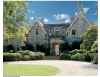
Q4 2&6 Ginahgulla Rd & 49 Fairfax Rd Bellevue Hill • $20.5million