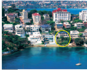
Q3 42a Wolseley Rd, Point Piper $12.5million