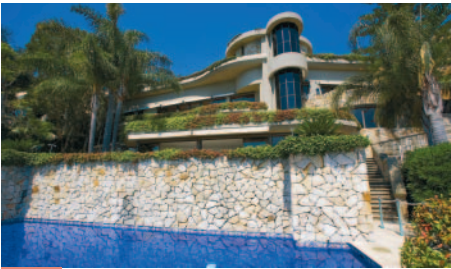
Q1 110 Wolseley Road, Point Piper $20-21million