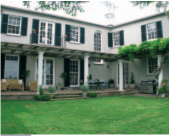
Q1 20 The Crescent, Vaucluse $11million

highest value transactions per quarter in 2004/05