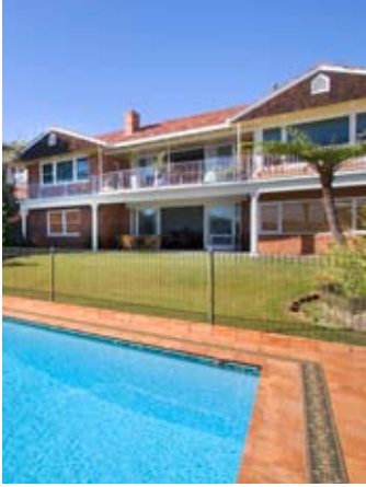
Q1. 2 Loch Maree Place, Vaucluse $12.5million