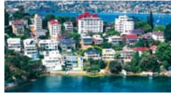
Q3. 42a Wolseley Road, Point Piper $12.5million