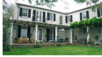
Q1. 20 The Crescent, Vaucluse $11million