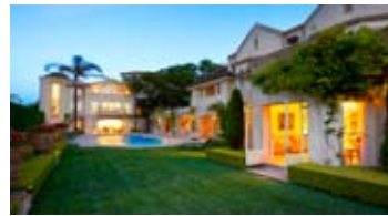
Q3. 7 Rose Bay Avenue, Bellevue Hill $15.7million