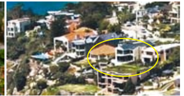
Q2. 4 & 6 Burran Avenue, Mosman $20.5million