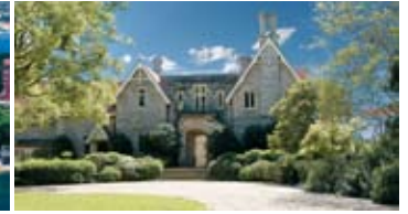
Q4. 2&6 Ginahgulla Rd & 49 Fairfax Rd, Point Piper $20.5million