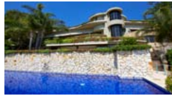
Q1. 110 Wolseley Road, Point Piper $20.6million