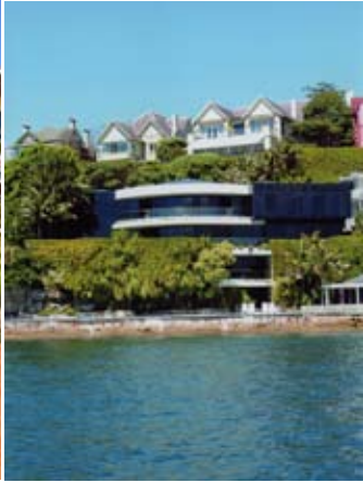
Q2. 9 Wolseley Crescent, Point Piper $24million