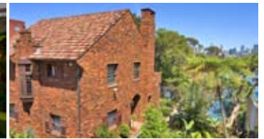
Q4. 88 Wolseley Road, Point Piper $16million*