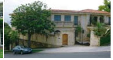
Q2. 63 Wolseley Road, Point Piper $21.5million