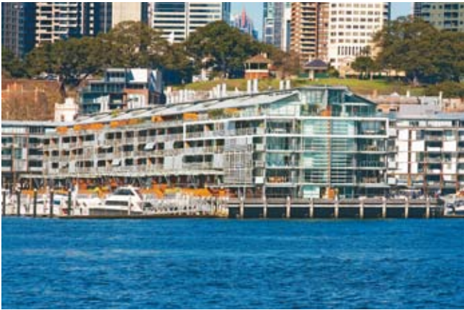
Q3. 528/19 Hickson Road, Walsh Bay $16million*