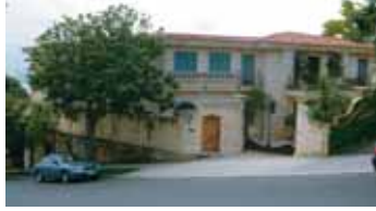
Q2. 63 Wolseley Road, Point Piper $21.5million