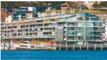
Q3. 528/19 Hickox Road, Walsh Bay $16million*