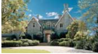
Q4. 2&6 Ginahgulla Rd & 49 Fairfax Rd, Point Piper $20.5million