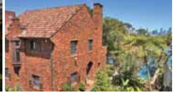
Q4. 88 Wolseley Road, Point Piper $16million*