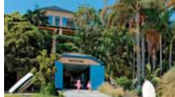
Q1. 50 The Crescent, Vaucluse $16.1million