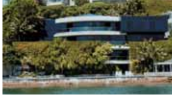
Q2. 9 Wolseley Crescent, Point Piper $24million