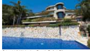
Q1. 110 Wolseley Road, Point Piper $20.6million