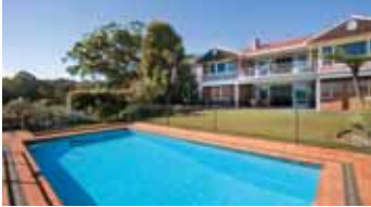
Q1. 2 Loch Maree Place, Vaucluse $12.5million