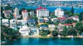
Q3. 42a Wolseley Road, Point Piper $12.5million