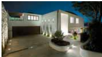
Q4. 2 Bayview Hill Road, Rose Bay $18-$18.5million