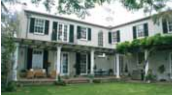
Q1. 20 The Crescent, Vaucluse $11million