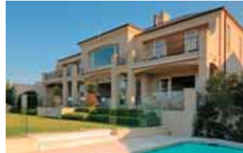
Q2. 9 Wentworth Place, Point Piper $13.8million