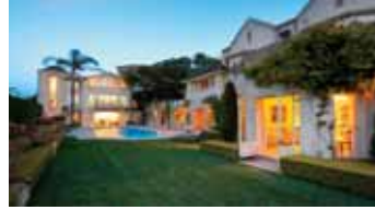
Q3. 7 Rose Bay Avenue, Bellevue Hill $15.7million