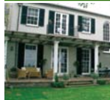
20 The Crescent, Vaucluse SOLD for $11 million