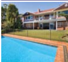
2 Loch Maree Place, Vaucluse SOLD for $12.5 million