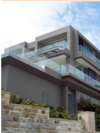
99 Wentworth Road, Vaucluse SOLD for $20 million