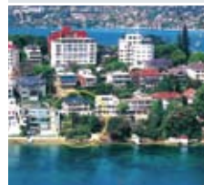
42a Wolseley Road, Point Piper SOLD for $12.5 million