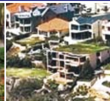
4 & 6 Burran Avenue, Mosman SOLD for $20.5 million