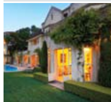
7 Rose Bay Avenue, Bellevue Hill SOLD for $15.7 million