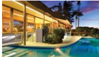
22D Vaucluse Road, Vaucluse SOLD for $29 million