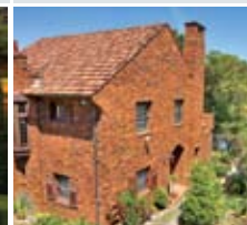
88 Wolseley Road, Point Piper SOLD for $16 million*