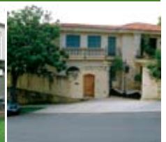
63 Wolseley Road, Point Piper SOLD for $21.5 million