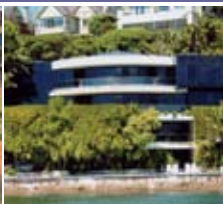
9 Wolseley Crescent, Point Piper SOLD for $24 million