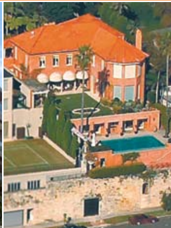
73-75 Wolseley Road, Point Piper SOLD for $32.4 million