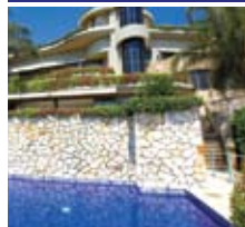
110 Wolseley Road, Point Piper SOLD for $20.6 million