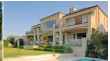
9 Wentworth Place, Point Piper SOLD for $13.8 million