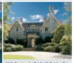
2&6 Ginahgulla Rd & 49 Fairfax Rd, Point Piper SOLD for $20.5 million