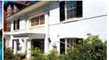
26-28 Wolseley Road, Point Piper SOLD for $25 million