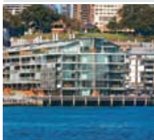
528/19 Hickson Road, Walsh Bay SOLD for $16 million*