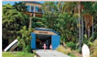
50 The Crescent, Vaucluse SOLD for $16.1 million