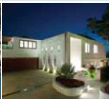
2 Bayview Hill Road, Rose Bay SOLD for $18-$18.5 million