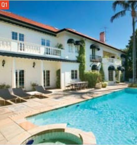
5 Rose Bay Avenue, Bellevue Hill SOLD for $17 million