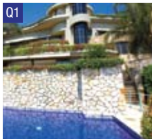
110 Wolseley Road, Point Piper SOLD for $20.6 million