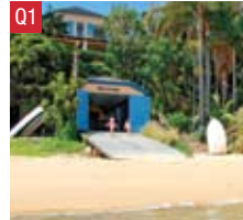
50 The Crescent, Vaucluse SOLD for $16.1 million