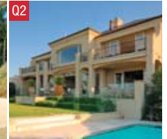
9 Wentworth Place, Point Piper SOLD for $13.8 million