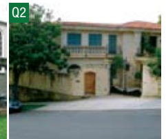
63 Wolseley Road, Point Piper SOLD for $21.5 million