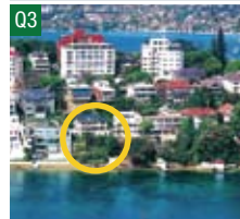
42a Wolseley Road, Point Piper SOLD for $12.5 million