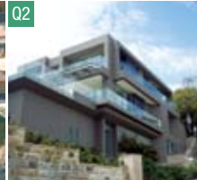
99 Wentworth Road, Vaucluse SOLD for $20 million