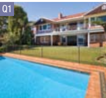
2 Loch Maree Place, Vaucluse SOLD for $12.5 million