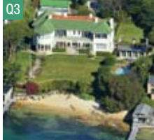
23-25 Coooling Road, Vaucluse SOLD for $45 million