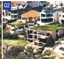
4 & 6 Burran Avenue, Mosman SOLD for $20.5 million