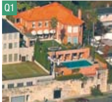
73-75 Wolseley Road, Pt Piper SOLD for $32.4 million