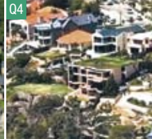
4 & 6 Burran Avenue, Mosman SOLD for $19.75 million