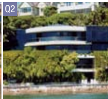
9 Wolseley Crescent, Point Piper SOLD for $24 million