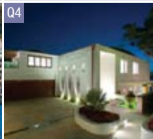
2 Bayview Hill Road, Rose Bay SOLD for $18 - $18.5 million