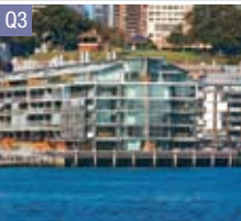
528/19 Hickson Road, Wahs Bay SOLD for $16 million*