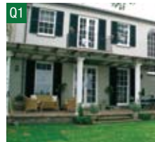
20 The Crescent, Vaucluse SOLD for $11 million