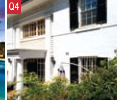
26-28 Wolseley Road, Pt Piper SOLD for $25 million