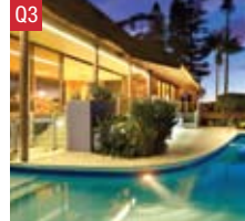
22D Vaucluse Road, Vaucluse SOLD for $29 million