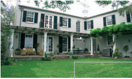
Q1. 20 The Crescent, Vaucluse $11million