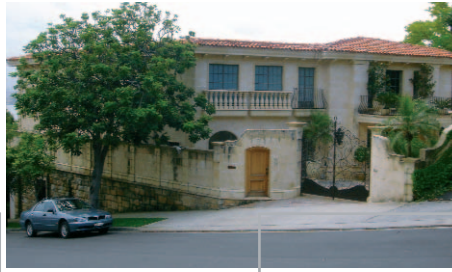
Q2. 63 Wolseley Road, Point Piper $21.5million