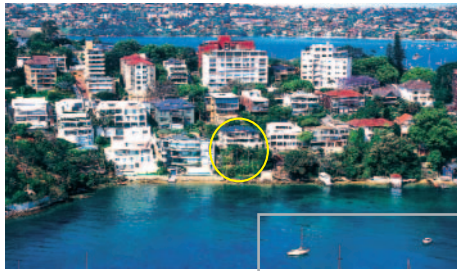
Q3. 42a Wolseley Rd, Point Piper $12.5million