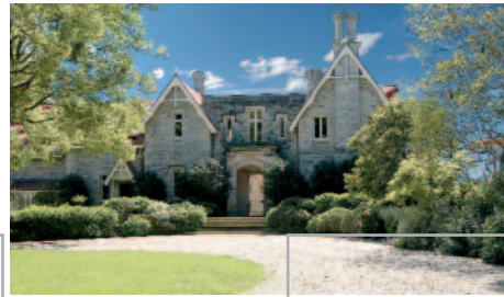
Q4. 2&6 Ginahgulla Rd & 49 Fairfax Rd Bellevue Hill $20.5million